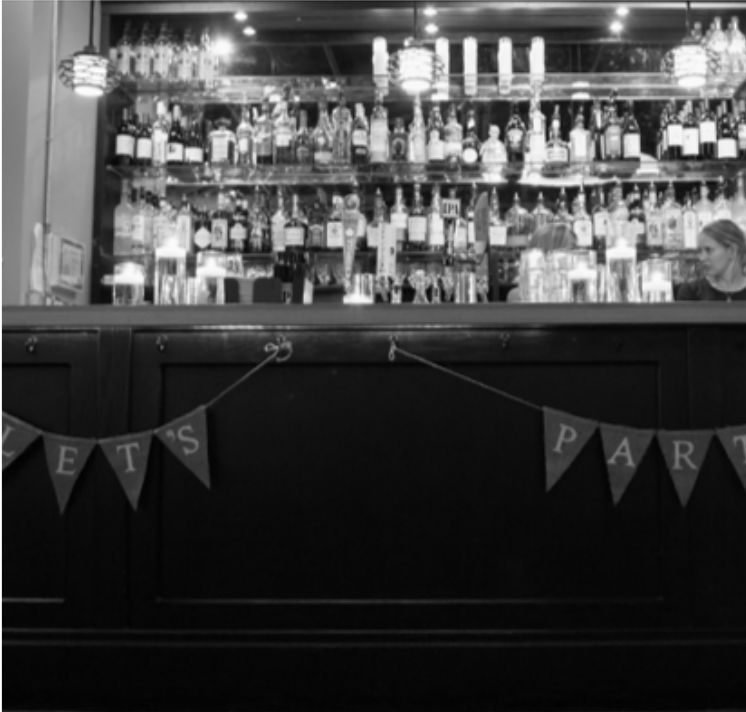
TABLE SEATING FOR UP TO 100 WITH RENTALS COCKTAIL UP TO 200

With its rustic charm and well-equipped facilities, SPACE is the perfect spot for hosting a private event. A flexible setup, state-of-the-art lighting and sound system allow us to play host for a variety of parties & corporate events. Enjoy delicious appetizers and dinner from Union Pizza and sip on one of the many craft cocktail options from the bar.